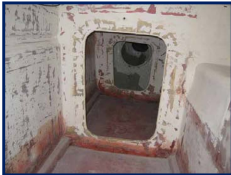
Cabin Looking Forward

This is a super center console sport fish with an air conditioned cuddy cabin with berth, 2 heads and galley. The aft is dedicated to fishing with two fighting chairs, bait wells and fish boxes. Forward of the console is space for casting or drift fishing. In the bow is an air conditioned cuddy cabin with berth, head and galley.